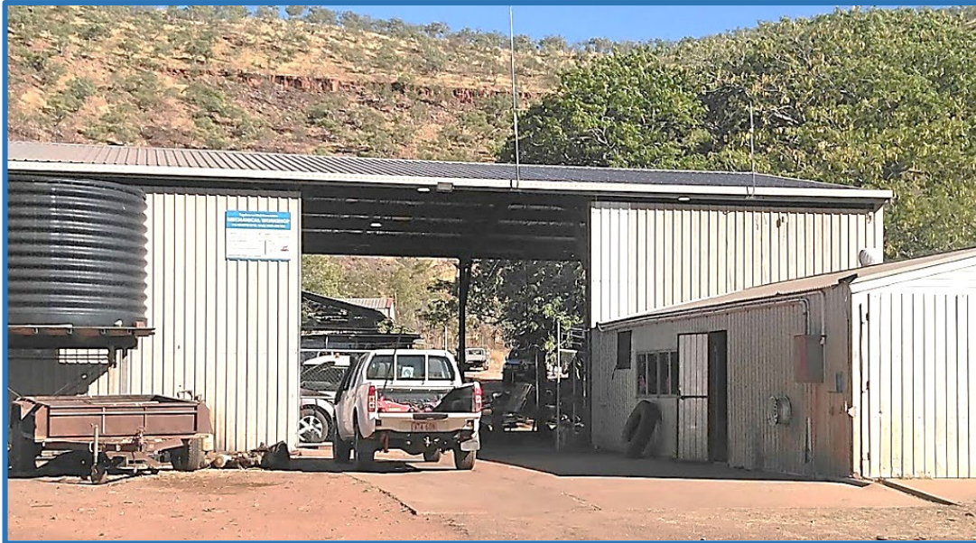
Above: NWAC Mechanical Workshop